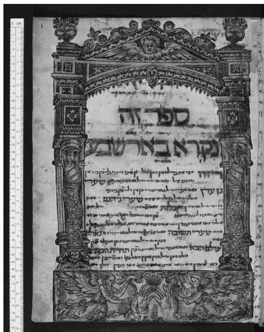
Figure 3. Ms Oxford Bodleian 148

Moreover, the intent behind this version—though apparently never achieved—was to prepare it for print. The title page states, in Riemer’s translation: